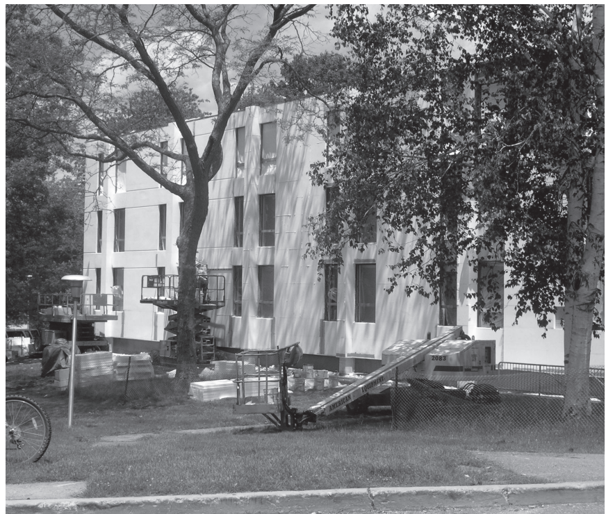
Hamilton House during summer 2006 renovations.