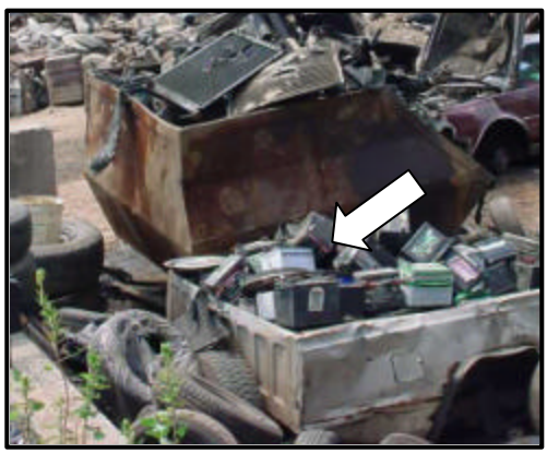
Batteries stored improperly

If handled improperly, lead acid batteries removed from vehicles pose certain hazards. Battery components are toxic and corrosive, and can also be a fire and explosion hazard. Lead and sulfuric acid can contaminate the air, soil and water. Direct contact with sulfuric acid can burn the skin and eyes. Exposure to lead in the environment can pose a serious health hazard to children. Lead is also very toxic to aquatic life.