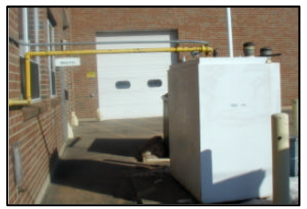
Double-walled above ground storage tank