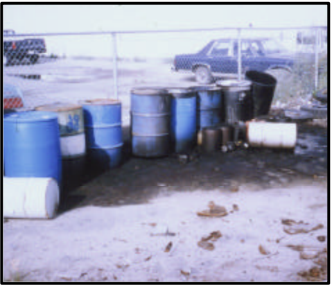
Improper used oil storage: leaking, unlabeled drums on ground