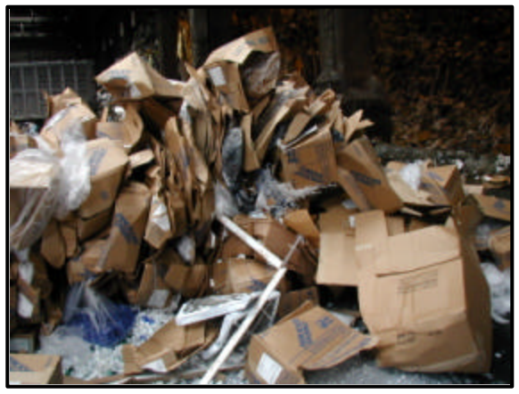
Illegally disposed corrugated cardboard and mixed waste

Throwing recyclables in the trash has negative impacts on air and water quality and wastes energy and natural resources. Diverting reusable materials from the waste stream through recycling results in using fewer raw materials and reduces the amount of waste that must be landfilled or incinerated. Note: If your business dismantles vehicles, please see the Auto Recycling Compliance Guide at <u>www.dep.state.ct.us/enf/autorecyclingguide.pdf</u>. for more information on recycling scrap metal and scrap catalytic converters.