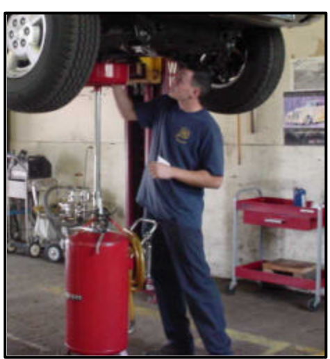
Vacuum-type drain system