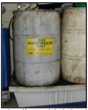
Used antifreeze, labeled and stored on secondary containment

Connecticut Department of Environmental Protection, 79 Elm Street, Hartford, CT 06106-5127 Office of Pollution Prevention (860) 424-3297 <u>www.dep.state.ct.us/wst/p2/vehicle/abindex</u>. Fact Sheet: DEP-P2-PITSTOPS-FS-001 Last Updated: August, 2004