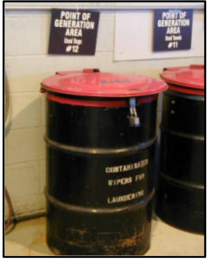
Proper storage of used rags