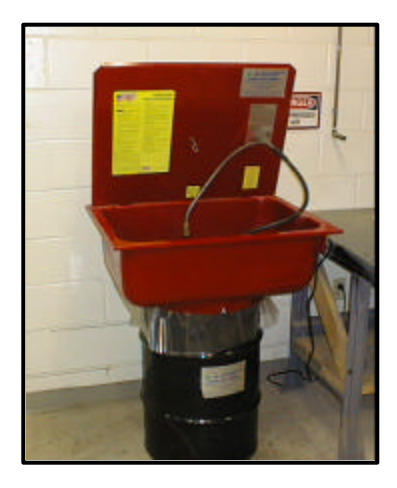
Solvent Parts Washer (lid should be closed when not in use)

Degreasers used to clean metal parts may be solvents (chlorinated or non-chlorinated) or aqueous (water-based) cleaners. Solvent degreasers can be derived from variety of sources ranging from petroleum to orange peels. They usually contain volatile organic compounds (VOCs) that can evaporate quickly and combine with combustion emissions to form ground level ozone, a major component of "smog." Ozone damages lungs and degrades many materials. When solvents are released and reach water, even in very small quantities, they may render the water unfit for human consumption and uninhabitable for aquatic life. Many solvents are also flammable and may pose a fire hazard.