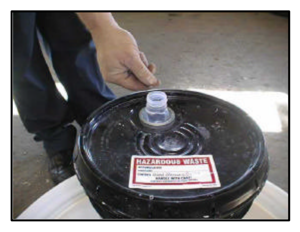
Proper storage of mercury switches