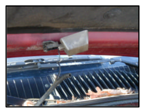
Hood light fixture with mercury switch assembly

Vehicle trunk and hood light switches can contain mercury. A mercury switch is probably being used if the light goes on when the hood is partway up, or you can see that the bulb housing is deliberately mounted at an angle to the hood, Most cars containing mercury switches are American makes and models. For information on the known makes and model of vehicles that contain mercury switches, call the Office of Pollution Prevention at (860) 424-3297.