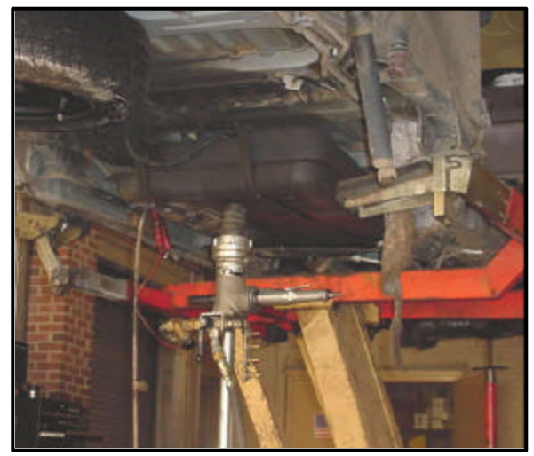
Removing gasoline with a tank drilling machine