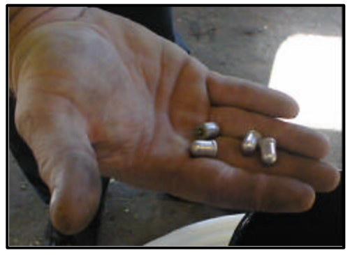
Mercury switches removed from vehicle light assemblies

When mercury switches from certain hood and trunk lighting assemblies are not removed prior to compacting or shredding, mercury is released into the environment. Mercury is highly toxic to humans and the environment. It accumulates in the tissues of fish and other organisms in mercury-contaminated water and may be carried up the food chain to humans. Removal and proper management of the mercury switches in vehicles destined for salvage is an important part of keeping mercury out of the environment.