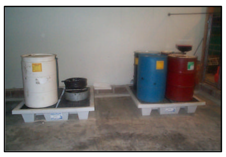
Proper waste storage – closed, labeled drums stored inside with secondary containment

CESQGs have the fewest requirements of the three hazardous waste generators. The requirements and best management practices (BMPs) for CESQGs are listed below. If you would like more information on these requirements and BMPs, contact the CT-DEP's Waste Engineering and Enforcement Division at (860) 424-3023 and ask for the Small Quantity Generator Guidance booklet. Several other helpful documents which are available are also listed at the end of this section.