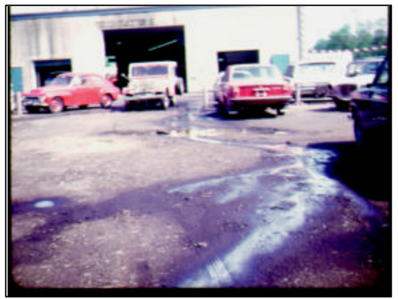
Shop wastewater directed outside is an illegal discharge.

Vehicle maintenance wastewater is floor washdown and incidental drippage from vehicles as a result of routine servicing operations, washing vehicle exteriors or steam cleaning engines, or vehicle dismantling or crushing. It may contain chemicals such as oils, degreasers, gasoline, diesel fuel, detergents, heavy metals and antifreeze. In some instances it may contain solvents. If discharged through a dry well or septic system to the ground, these chemicals may render drinking water supplies unfit for human consumption. If discharged directly or indirectly to surface water these chemicals can be toxic to fish and other aquatic life.