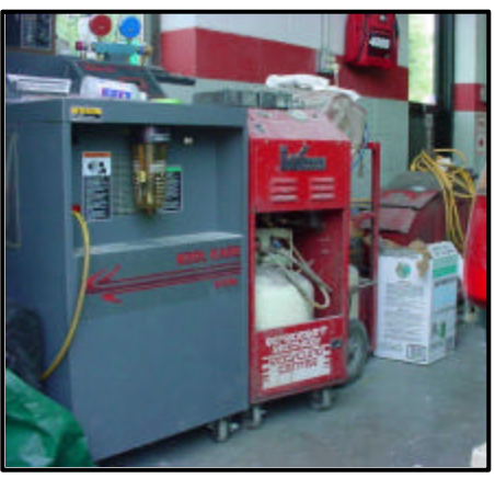
Refrigerant recovery equipment, CFC-134a (left) and CFC-12 (right)