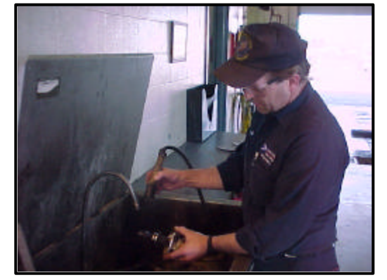
Using an aqueous-based parts washer