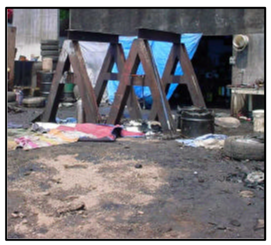
Outside dismantling area contaminated with improperly drained vehicle fluids