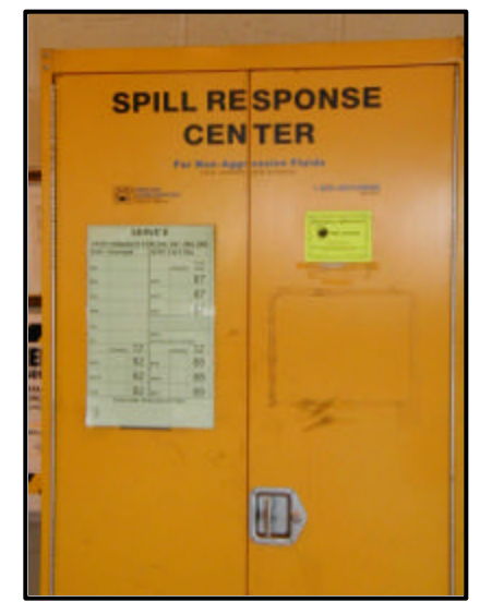
Cabinet with spill response materials

Designate an emergency coordinator and post the name and telephone number of this coordinator next to the onsite telephone, along with the locations of fire extinguishers and spill control material, the fire alarm (if you have one), and the telephone number of the local fire department (i.e., 911). Make arrangements with local emergency response authorities to coordinate emergency services in the event of an emergency.