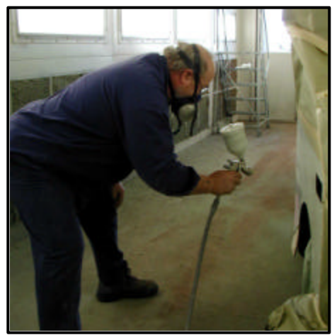
Painting with HVLP gun in spray booth